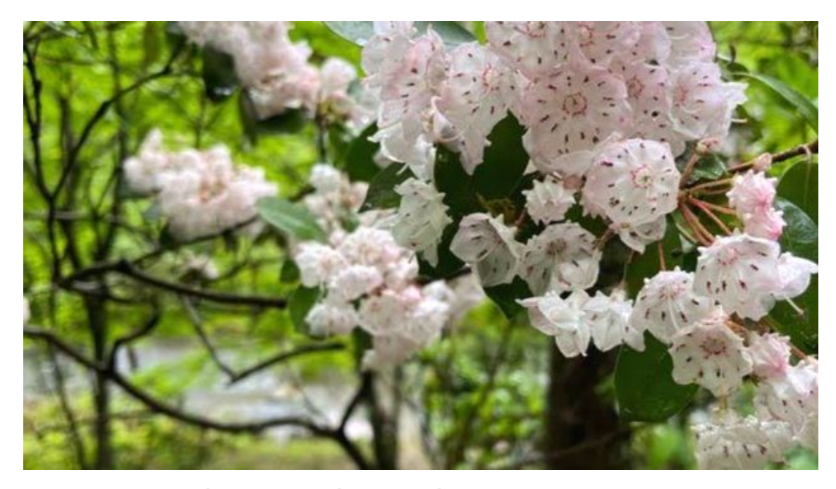
Current Grant Opportunities

Stay tuned for more news related to our partnership with NCORR's RISE program! In the meantime, we encourage you to dive into the <u>Regional Resilience Portfolio Program</u> where RISE highlights needs for each of the NC Council of Governments in their focus areas. For example, you can read the <u>Climate Resilient Projects for the Albemarle Region</u>.