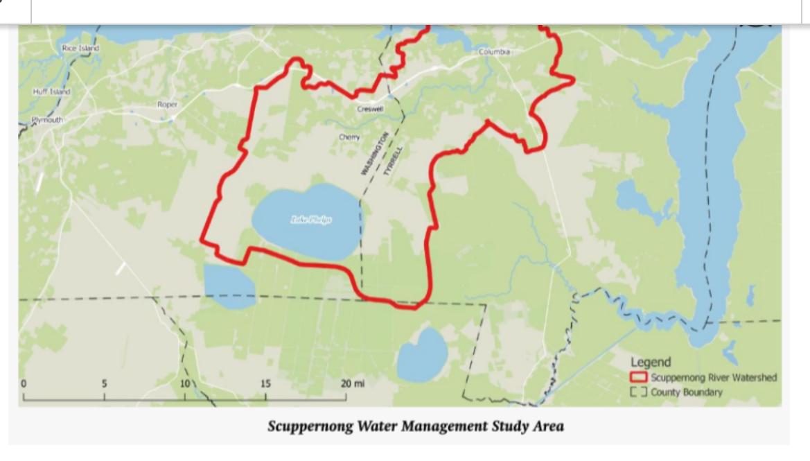
Click to explore the Scuppernong River!

The Scuppernong River Basin in the heart of the Albemarle-Pamlico region in eastern North Carolina faces significant water management challenges due to factors such as changing precipitation patterns, manipulated land-use, and increasing water demand. There has been an increasing need to assess how water moves throughout the landscape to develop data driven strategies for alleviating the negative impacts of flooding for residents and businesses in Columbia, Creswell, Cherry, and surrounding communities.