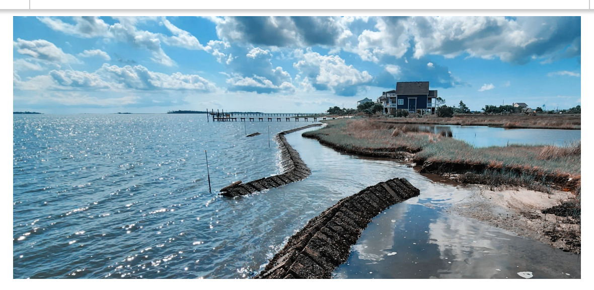
2023 National Estuary Program Watersheds Grant

Restore America's Estuaries announces the availability of the 2024 National Estuary Program Watersheds Grant Request for Proposals!