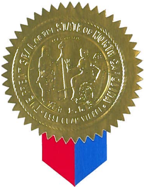
Beverly Eaves Perdue Governor

IN WITNESS WHEREOF , I have hereunto signed my name and affixed the Great Seal of the State of North Carolina at the Capitol in the City of Raleigh, this 5th day of November in the year of our Lord two thousand and twelve, and of the Independence of the United States of America the two hundred and thirty-seventh.