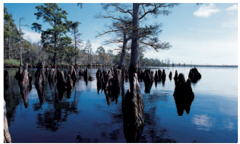
Bald cypress "knees"

The region is also steeped in a rich tradition of farming. It contains the state's largest tobacco-producing county (Pitt) and the number one producer of corn, wheat and sorghum (Beaufort County).