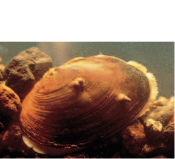
us. Fish and wildlife service Tar River Spinymussel

The Tar River and Pamlico River are actually two ecologically distinct pieces of the same river. The 180-mile river rises as a freshwater stream (the Tar) in the Piedmont