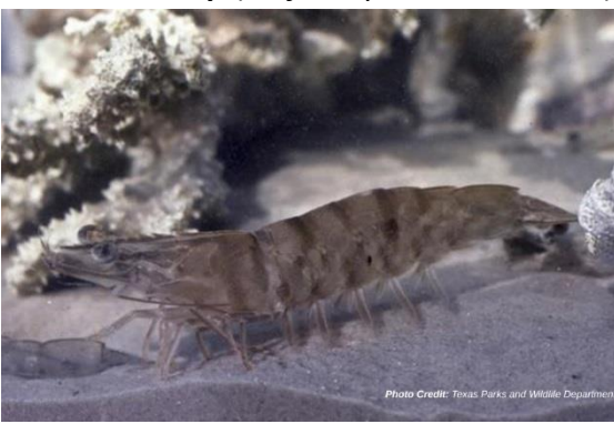
Brown Shrimp (Farfantepenaeus aztecus)

http://www.chesapeakebay.net/fieldguide/critter/bristle_worms