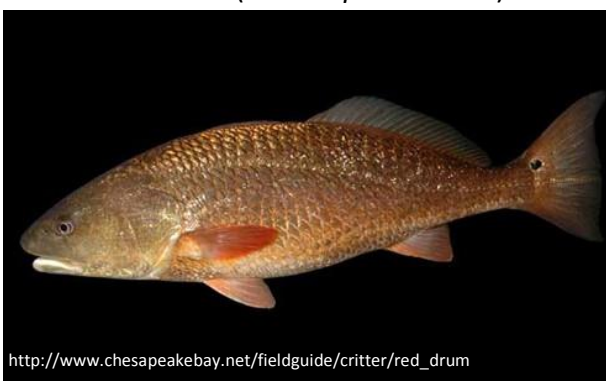
Red Drum (Sciaenops ocellatus)

http://www.elasmodiver.com/atlantic_stingray.htm http://nersp.nerdc.ufl.edu/~pmpie/dsabina.html