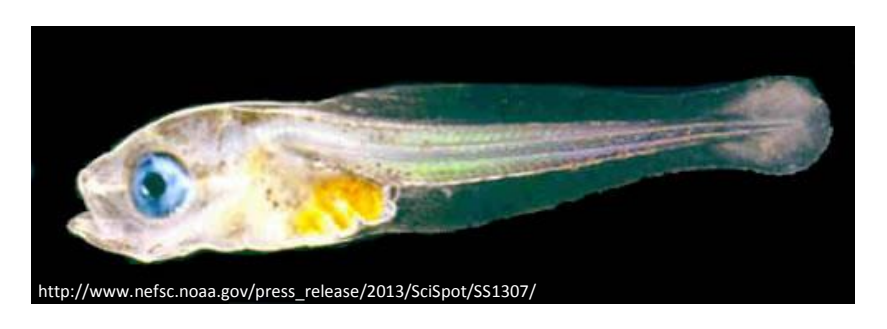
Fish Larvae (zooplankton)

http://portal.ncdenr.org/web/mf/nc-shrimphttps://a-z-animals.com/animals/flounder/http://gulffishinfo.org/Species?SpeciesID=106