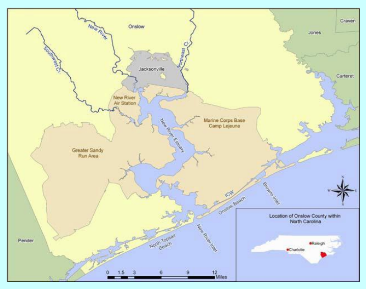
For more information, visit: https://dcerp.rti.org/

N.C. Division of Emergency Management: Sea Level Rise Risk Management Study