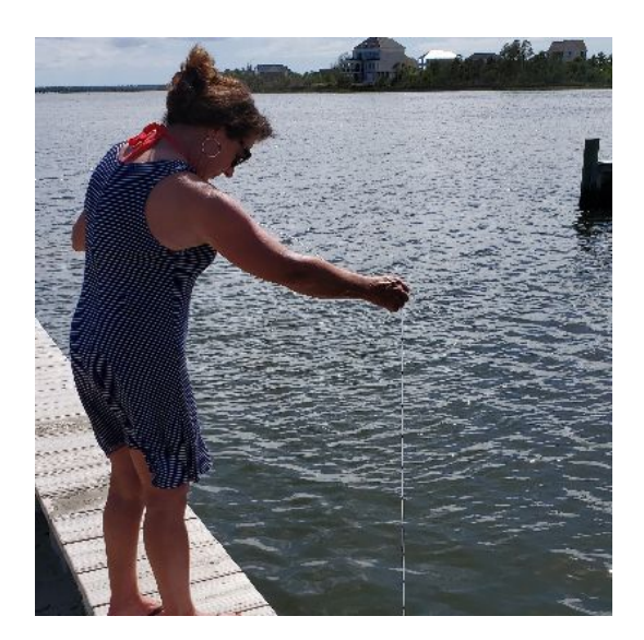
Learn more about SAV monitoring in the Albemarle-Pamlico region