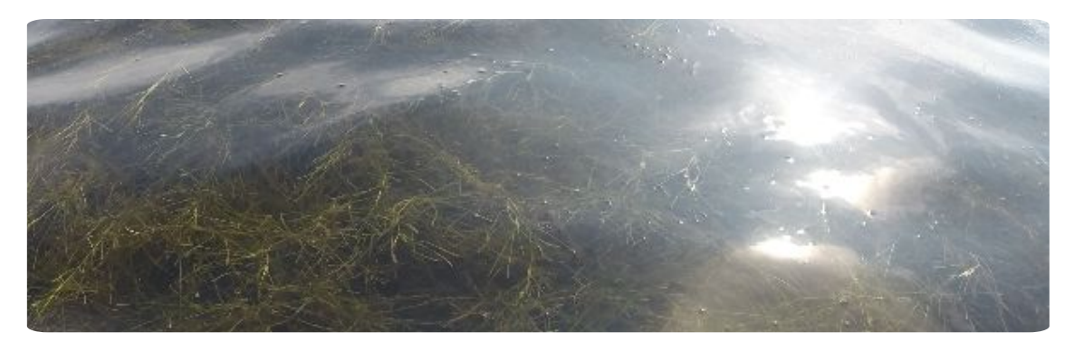
The Pew Charitable Trusts Highlights Importance of NC's Seagrasses