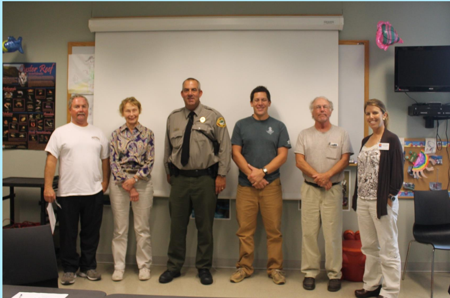
Rachel Carson Reserve LAC meeting, November 2013